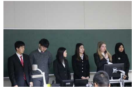
Post-program class/ presentation