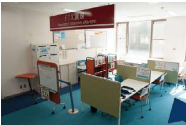
APU Library 1 F