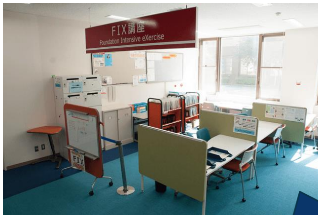
APU Library 1 F