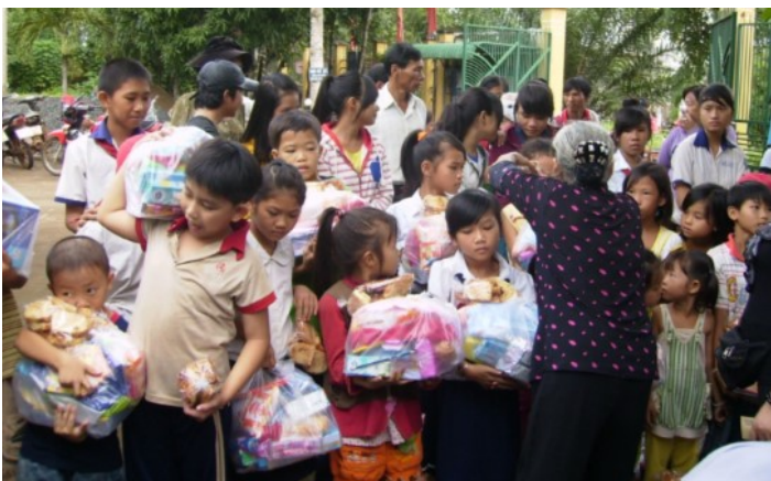
A Buddhist practitioner distributing gifts to rural kids at a school in a Southern Vietnam province.

The context of this research is Vietnamese population's rapid ageing due to lower birth-rate and longer life expectancy. Vietnamese elderly (defined as those above 60 years old by the Vietnamese government) accounts for more than 10 percent of its population in 2017. By exploring Vietnamese elderly's Buddhist social practice, this research hopes to gain insight into the experience of being old in Vietnam's rapidly changing society.