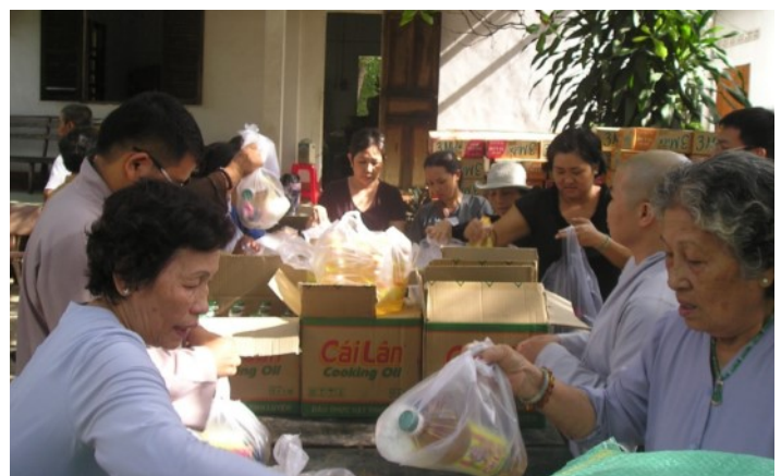
Buddhist practitioners sorting out gifts for people with leprosy in a lepers' village in a Southern Vietnam province.

To collect data for this research, I have conducted field research among charity givers and organizers in southern Vietnam. I have joined my informants in their charity events in hospitals, lepers' colonies and rural villages inside and outside of Ho Chi Minh City. I have participated in the various stages of my informants' charitable activities, from planning, fund raising, contacting local authorities and recipients and travelling to rural villages. Although the research is still ongoing, the field data I have collected so far highlights the connection between charitable activities and senior-aged charity-givers' sense of self-worth, social belonging and status.