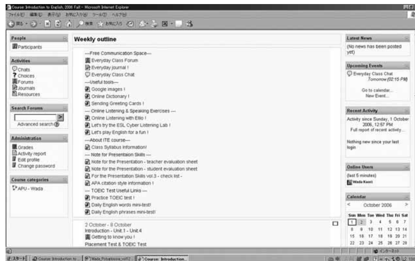
Figure 1. The view of the Moodle online course web page

All enrolled users need to enter their ID and Password when they login to the course. The online course was organized by weekly format (see Figure 1). On the top of the website, there is general course information. After their login, they will see both general information and the weekly information (see Wada, 2006). As the course covers one chapter per week, the weekly format was organized by chapters of the textbook. Each of the features is recognizable with their symbol marks for users. Learners can view the all of the forum view, or glossary view by clicking the screen. The learners' access times were counted during the period. Sometimes the simply visited the website for about five minutes, and sometime their continuous work period lasted for about two or three hours. The "Report" tools show the instructor how many times each learner visits the website, and the time, and how often they posted messages or viewed other's messages. When learners have multiple choice grammar review exercises, the program recorded how many times it took to complete the review test, how many times they attempted to take the test, and the score. According to the recorded data, we can see the each learner's patterns of usage including usage during class time.