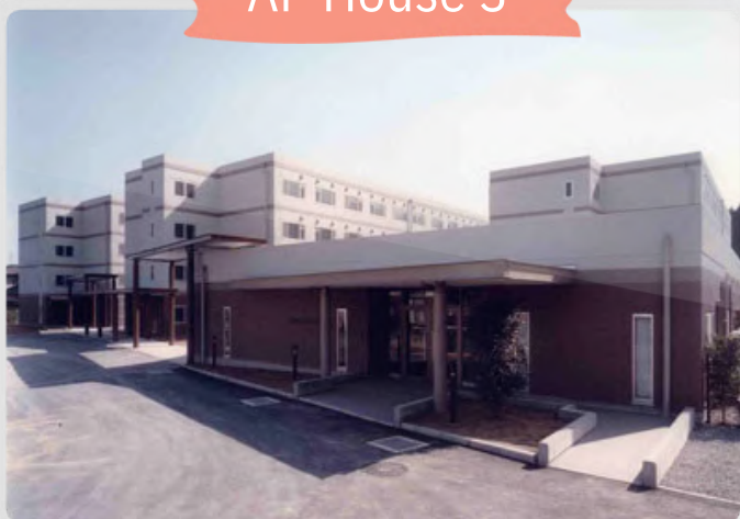
AP House 3