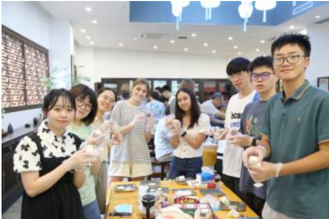
Mid-Autumn Festival, exchange in students and international students

Exchange students will be able to join a variety of activities together with all other inbound students: three-day orientation, experiential learning activities, traditional cultural field trips, company visits and Contemporary China lectures as well as cultural sharing workshops.