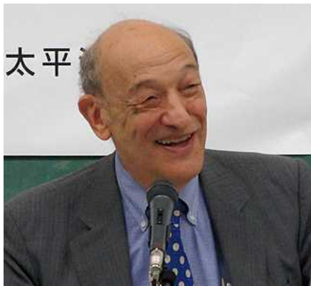
Professor Ezra Vogel during his 2013 visit to APU.

Ritsumeikan Asia Pacific University (APU) (Japanese: 立命館アジア太平洋大学) opened in April 2000 as Japan's first genuine international university. Nearly 20 years later, this multicultural and multilingual campus is home to 6,000 students, half of whom come from 93 countries and regions outside Japan, and a faculty that is equally diverse. Over 18,000 alumni from more than 150 countries have experienced APU's unique bilingual approach to education. As a top-ranking university with accreditation from AACSB, UNWTO, TedQual certification, and a network of over 450 partner institutions around the world, APU and its community is leading the internationalization of higher education in Japan. Learn more at http://en.apu.ac.jp/ .