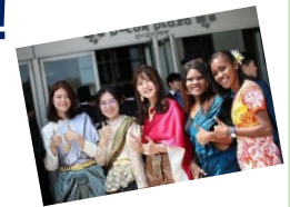
Photo spots are popping up all over campus! Take photos to commemorate your Entrance Ceremony experience!