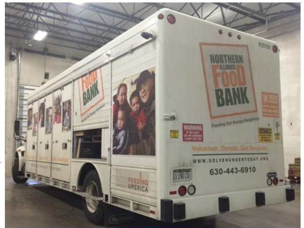
Northern Illinois Food Bank truck delivering donated food

My research has been largely focused on the establishment of accounting standards for non-profit organizations (hereafter 'NPOs'). At the preliminary stages of my research, I investigated the different types of non-profit accounting standards that exist in each country and did research on how to evaluate the effectiveness of non-monetary donations. The outcomes and results of my research are summarized in academic papers and books. For instance, I wrote a book chapter in “Food Banks: Support for the Hungry Around the World and Japan and Countermeasures Against Food Waste” (published by Akashi Shoten). My book chapter focuses on the accountability of American food banks. In it, I evaluate both the current state of the Japanese food bank system, the American NPOs and food banks, as well as their system for feeding the hungry. I have also contributed to the “Practical Handbook for Tax Accountants/Certified Public Accountants of NPOs” (published by Seibunsha).