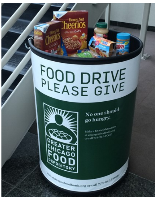
Greater Chicago Food Depository food donation bin