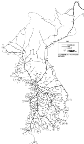
Station Road Network of the Joseon Dynasty