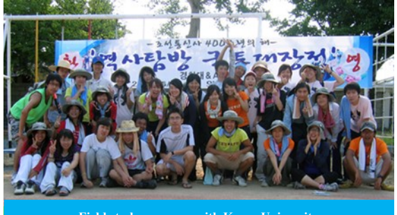
Field study program with Korea University

I am currently attempting to reconstruct the ancient road of Silla. Many Korean researchers have deemed this to be an impossible task due to the lack of available historical material. However, I believe the notion of this impossibility is the same reason why I will devote the rest of my life to working on this research.