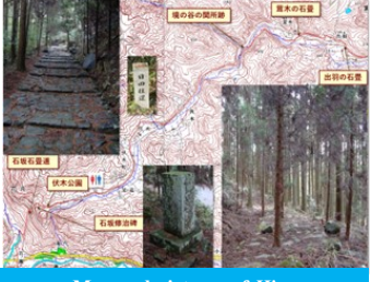
Map and pictures of Hita , Oita Prefecture