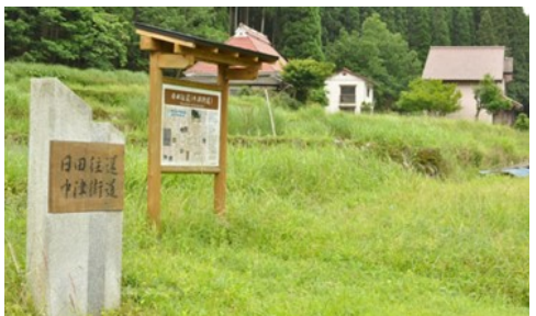
Hita Oukan Nakatsu Historical Street